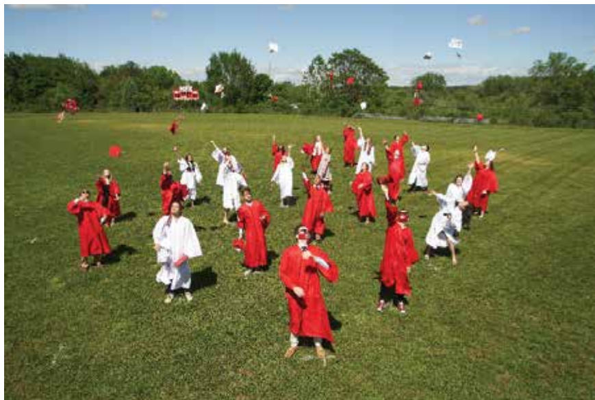
▲ The Class of 2020 leading the way in MPH’s transformation.

The ultimate success of these plans is contingent upon every individual — from the youngest to the oldest member of our community — committing to this social compact to safeguard the health and well-being of all. We appreciate the partnership of everyone in the MPH community as together we promote health and well-being, excellent education, transformative growth, and remarkable resilience.