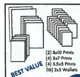
Package C BEST VALUE

Our background library has over 40 designs. Here are a few popular choices!